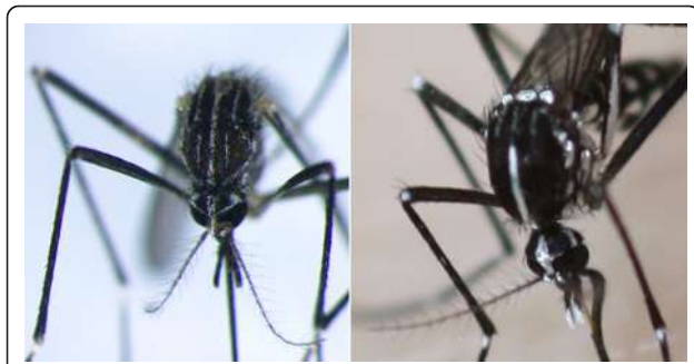
Figure 2 Particular of the mesonotum of Aedes koreicus (left) compared to Ae. albopictus (right).

albopictus , which is mainly based on the use of inexpensive ovitraps. The detection of the typical black Aedes eggs in ovitraps, easy recognizable by non-expert personnel, was sufficient to determine the infestation status of a location with regard to the tiger mosquito. Unfortunately, tiger mosquito eggs are indistinguishable by simple observation under a binocular microscope from the eggs of other Aedes spp., including those of Ae. koreicus . Hence, the species identification at a routine basis in areas where Ae. albopictus and Ae. koreicus may share the same breeding sites, will require to rear the eggs in the laboratory or to include into the surveillance system the more laborious systematic collection of larvae and adults, which require an equipped laboratory and well trained personnel for identification (Figure 2).